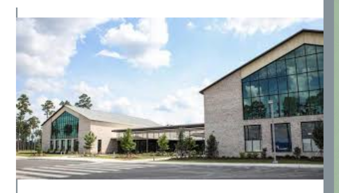
PCOM South Georgia Open House 5:30 p.m.-8 p.m. Thursday, April 2 2050 Tallokas Road Moultrie, GA 31769